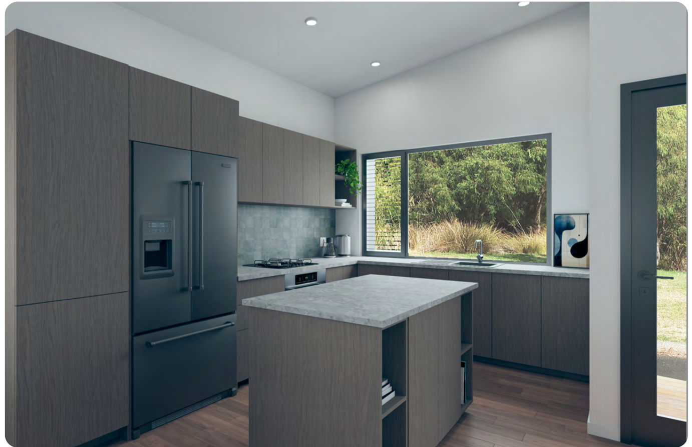
The Cooinda Kitchen- * For illustrative purposes only

The interiors of Cooinda are crafted to complement contemporary lifestyles. Featuring a soft, neutral colour scheme, clean architectural lines, and quality finishes, Cooinda offers a calm and inviting atmosphere throughout. The open-plan design brings the kitchen, dining, and living areas together in one harmonious space, enhancing everyday living and entertaining. Practical yet stylish, Cooinda is designed for comfort, connection, and ease.