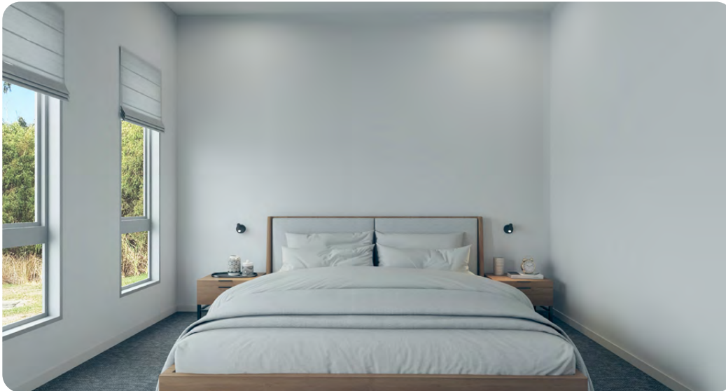
The Cooinda Living and Bedroom spaces- * For illustrative purposes only