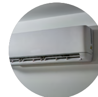
REVERSE CYCLE AIR CONDITIONING