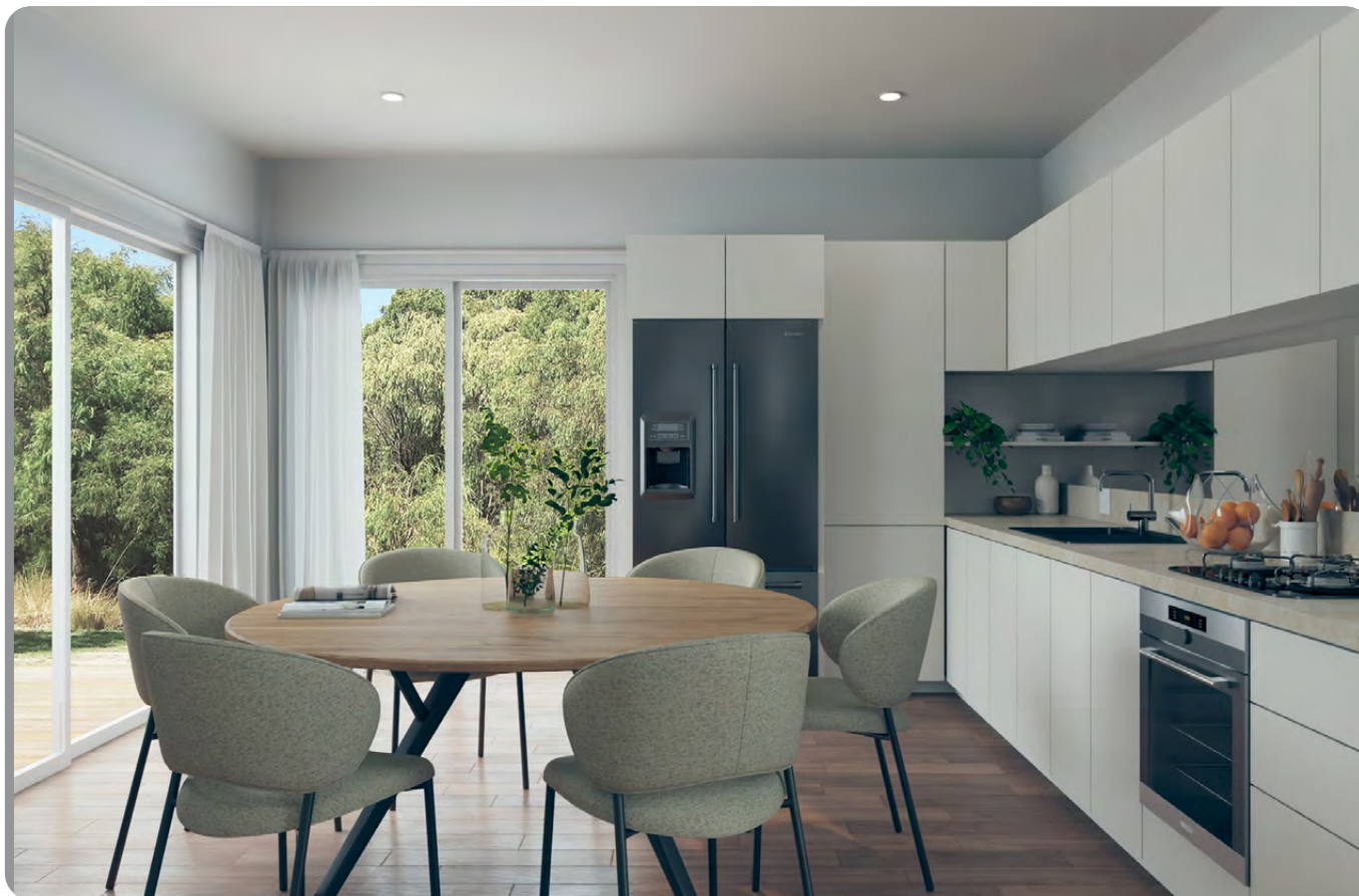
The Carinya Kitchen- * For illustrative purposes only

Inside Carinya, modern living takes centre stage. A neutral palette, clean lines, and carefully curated finishes create a warm, welcoming environment throughout. The open-plan layout effortlessly connects the kitchen, dining, and living areas, maximising space and flow. Designed for both comfort and functionality, Carinya's interiors are ideal for families, short-stay guests, and anyone seeking a stylish, low-maintenance home.