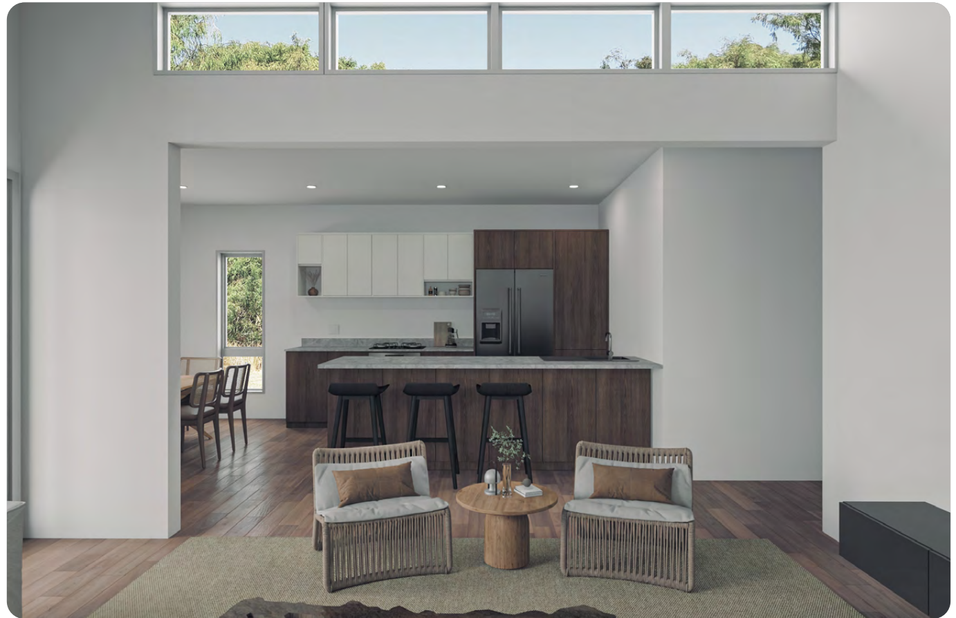
The Amaroo Living and Kitchen- * For illustrative purposes only

The Amaroo embraces modern living at its finest. A soft, neutral palette paired with clean lines and thoughtfully selected finishes creates a warm and inviting atmosphere. The open-plan design seamlessly links the kitchen, dining, and living spaces, enhancing both flow and functionality. Whether for families, short-term stays, or those looking for a stylish, low-maintenance lifestyle, the Amaroo's interiors offer comfort and convenience in equal measure.