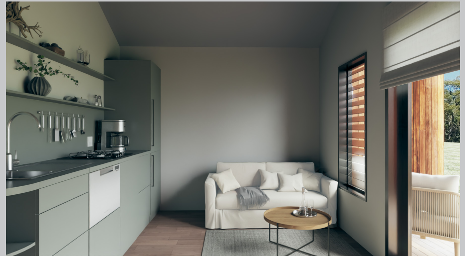
Corsette Living * For illustrative purposes only