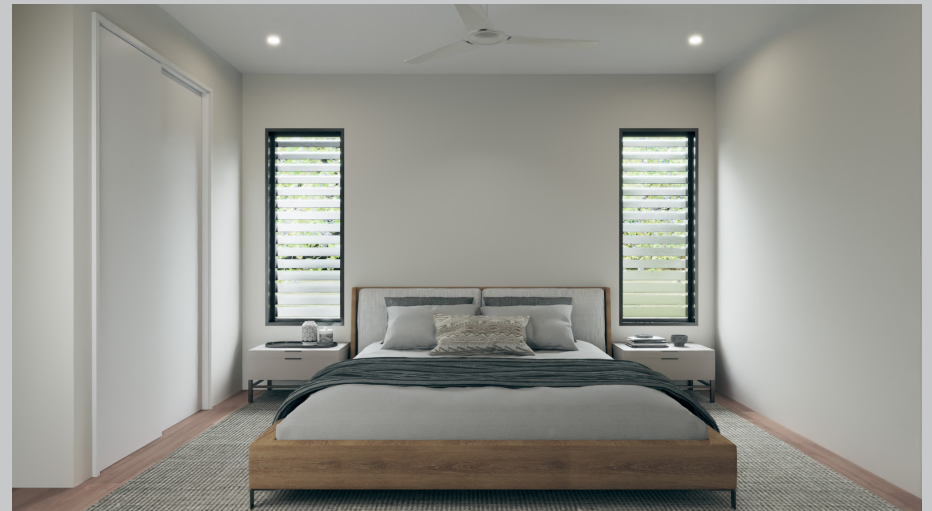
Corsette Bedroom * For illustrative purposes only